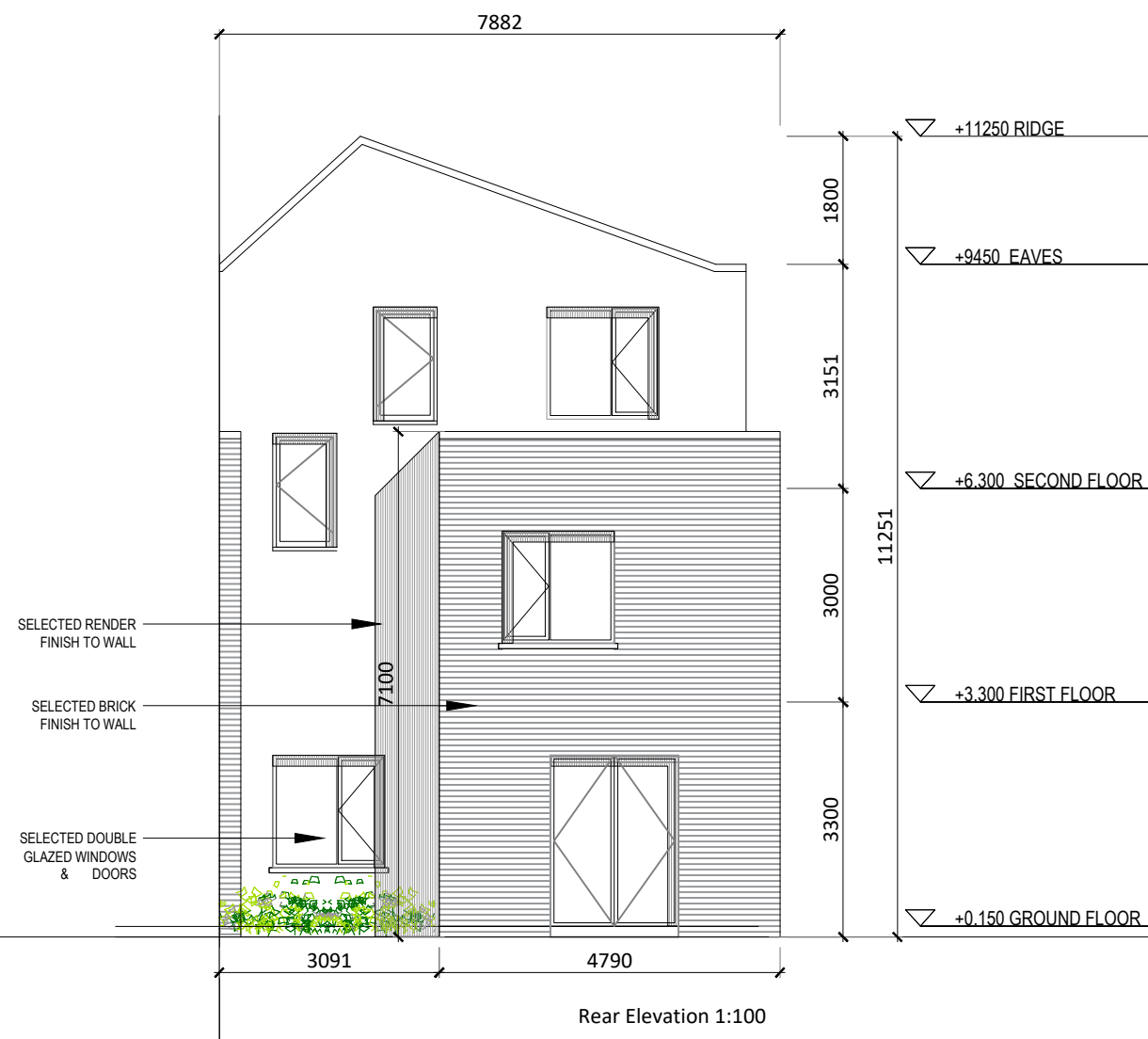
Rear Elevation 1:100